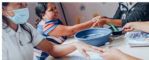
Learning to manicure!

Adult Education: On Saturdays we have adult education classes to learn to read and write. Many adults in the local area are illiterate. This makes basic tasks like finances, reading receipts or recipes, or helping children with schoolwork impossible! This is especially true for the women, who are more vulnerable to being taken advantage of without basic literacy! We want to change that.