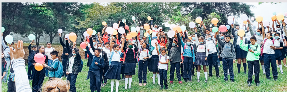
Outside for a little fun!