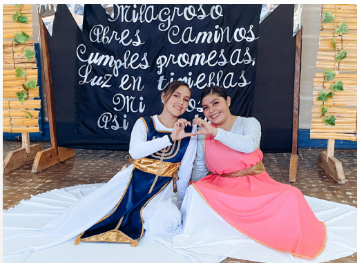
I call Him, Waymaker, Miracle Worker, Promise Keeper, Light in the Darkness